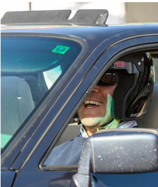
Left: Pure elation!