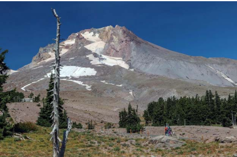
Above left: Has someone has been skiing?