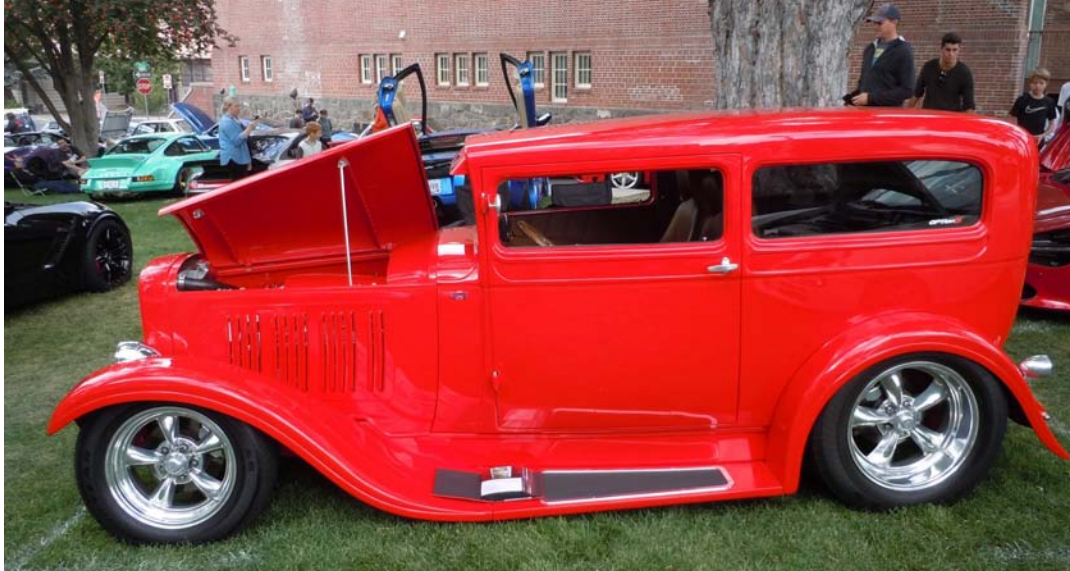
Clockwise from left: '28 Dodge; '95 Porsche RWB; '59 DKW; '57 Speedster; '62 Mini Cooper.