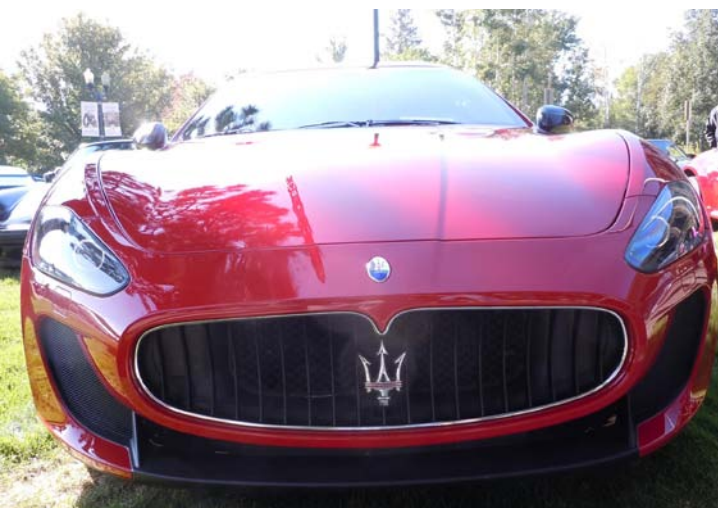
Clockwise from top: '66 Sunbeam Tiger; 17 Acura NSX; Maserati GT.