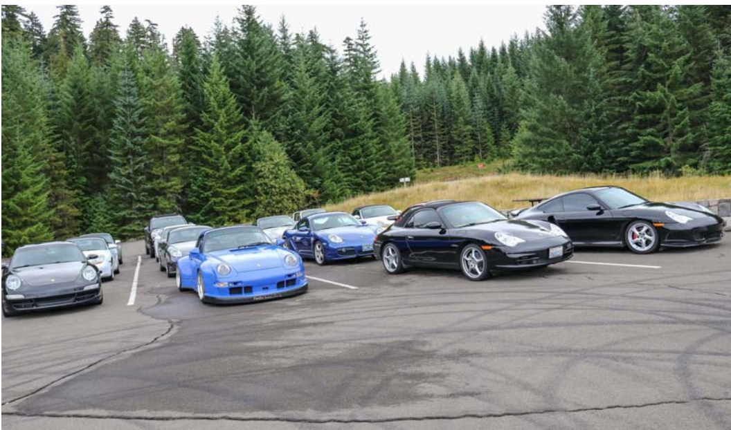
Clockwise from top: Last stretch to Skamania Lodge; Three photos from McClellan Overlook.