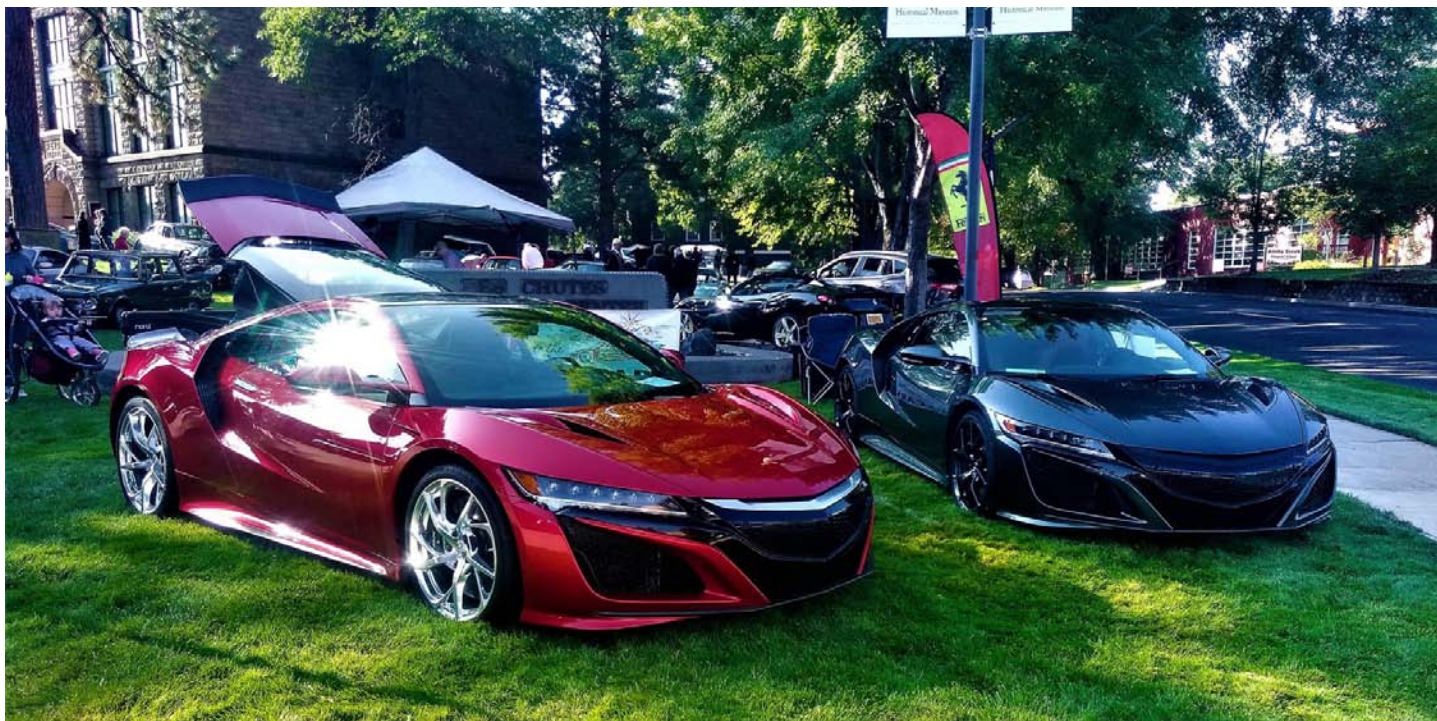
Two new NSXs were the headliners.