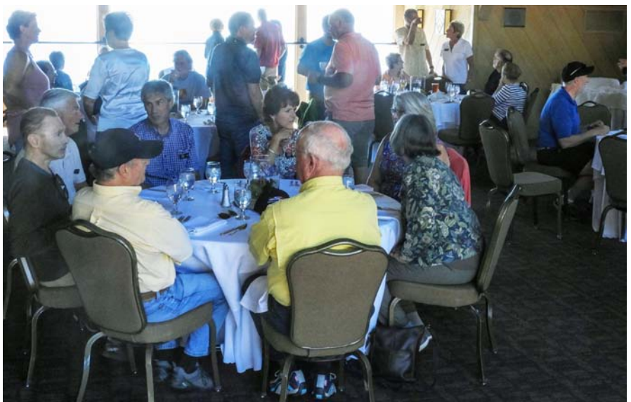
Above: Lunch in the Lodge.

We regrouped at the rest stop in Government Camp and proceeded on back roads to Lewis and Clark State Park.