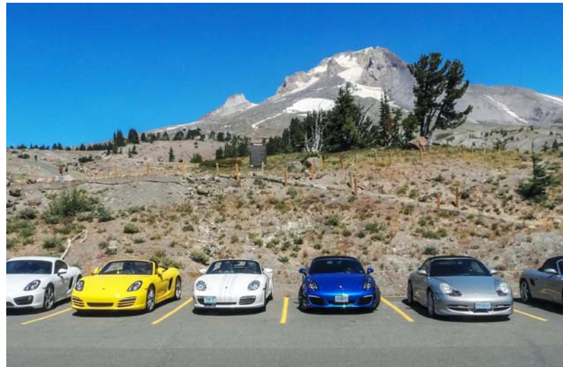
Above right: Cars parked at Timberline Lodge.