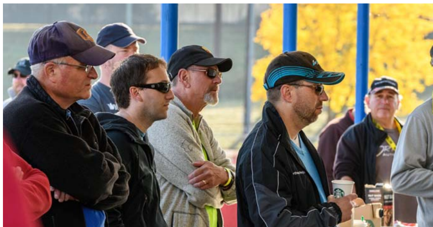
Above: Faces at the drivers meeting.

Here are photos from the day—we focused on the faces of Autocross! ■