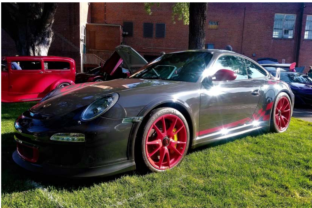
Clockwise from left: Great RS2 with red hot rod in the background; Amazing Porsche. great color! Ric Tiplady's Speedster; Slant-nosed—license plate was "Sick;" GT4 – could not get it onto the grass – the front was too low!