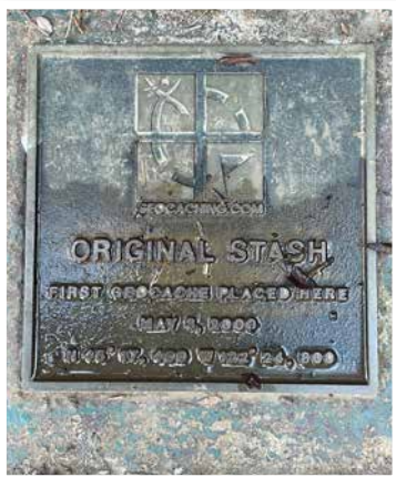
The birthplace of the world's first geo-cache stash!

K icking off the 2024 ORPCA drive season couldn't have been any more enjoyable than with our recent SUV Kickoff Drive. Enjoying a day of glorious sunshine, we had a fantastic turnout with 25 participants split into two groups, cruising in 13 sleek Porsche SUVs, and one Aston-Martin SUV.