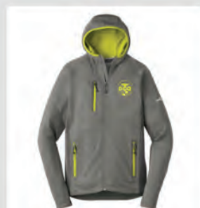
Eddie Bauer Men's Sport Hooded Full-Zip Fleece Jacket