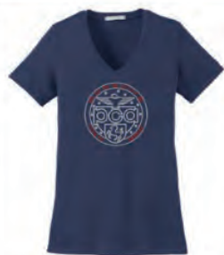
PCA logo Rhinestone Ladies Scoop T-shirt