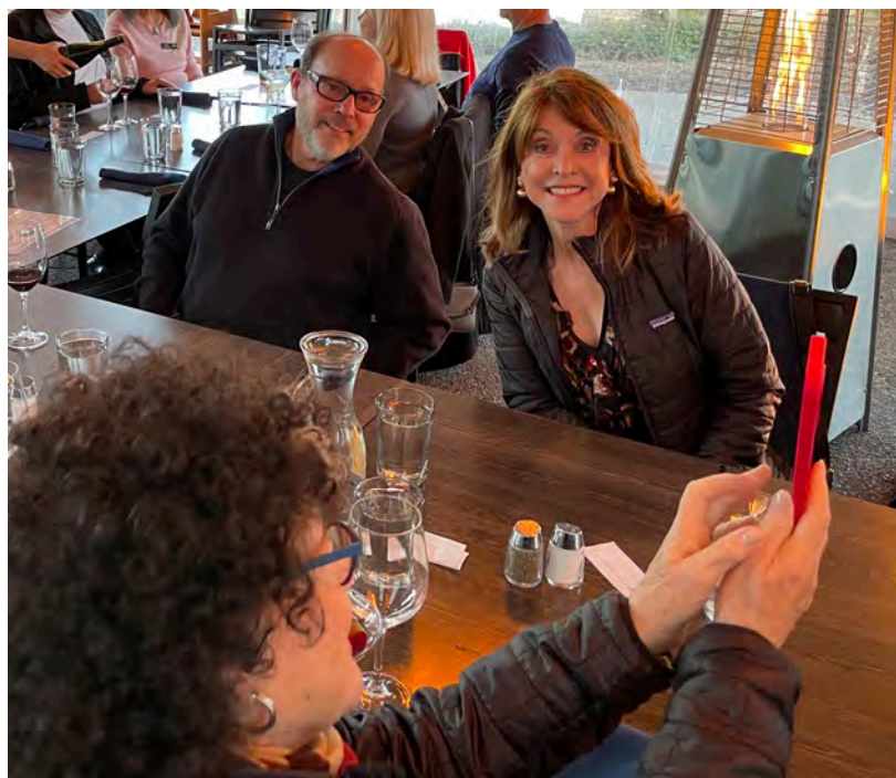
Monthly Dinners are just one of the social events offered by ORPCA.

Then I got invited to join a private, informal driving group of club members. The drives are named "Posse Drives" where the whole group follows a leader who has developed a route with the objective of finding unknown roads less travelled. These drives typically end with a picnic, and they are staged in all variety of weather—snow, rain, or shine. There are multiple simi-