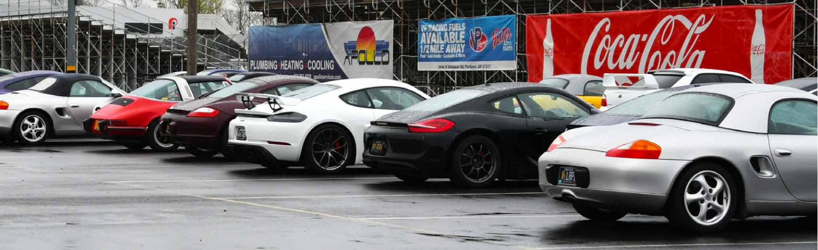
(Above) Parked and ready to head to the grid.