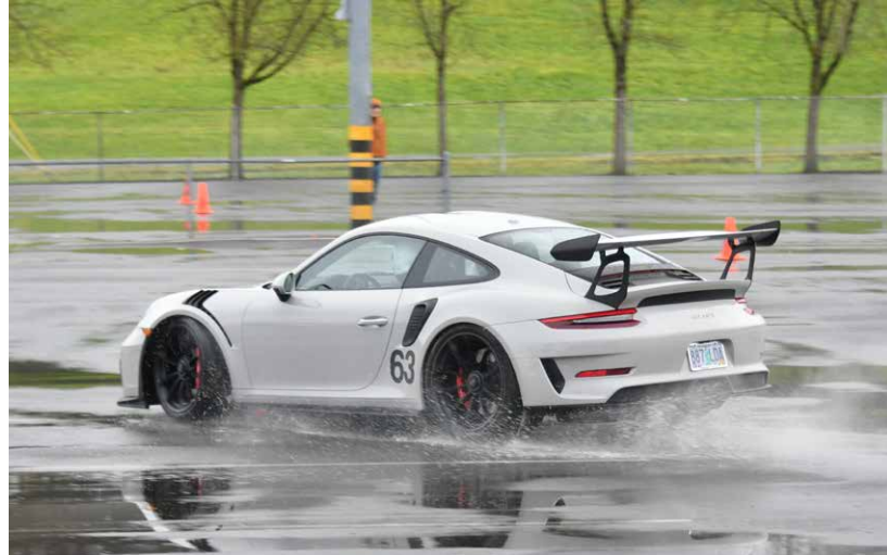
Tong Qi trying to hook up in his 2019 Porsche GT3 RS.