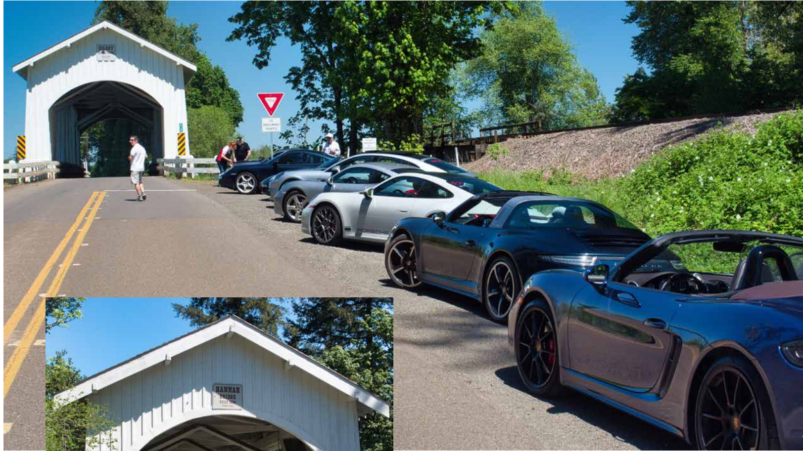
Lined up to visit the Gilkey Covered Bridge – Built in 1939.