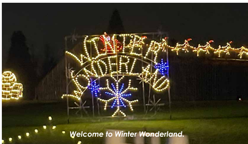
Welcome to Winter Wonderland.