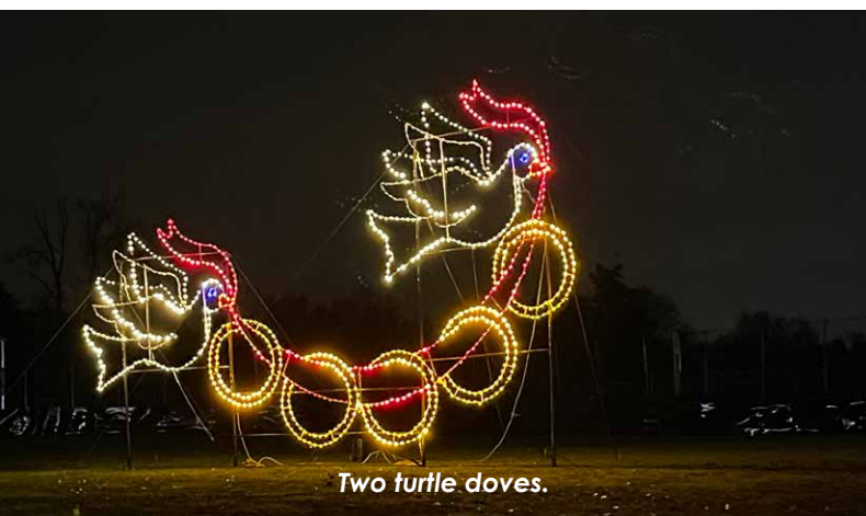
Two turtle doves.