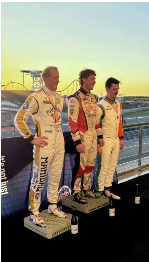
Parting shot... Podium at COTA

Stay healthy and we will see you in the Zone! ■