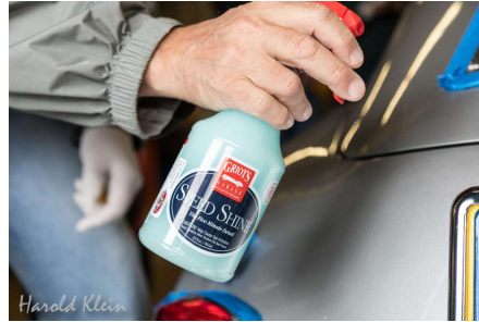
Speed shine wets it down