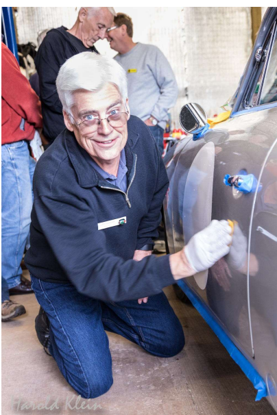
Ready to try!