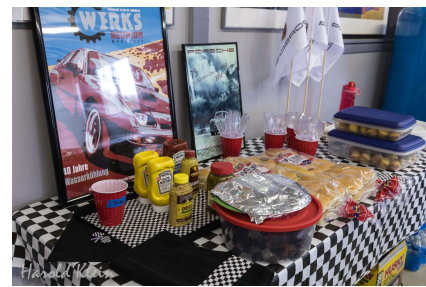
Chili dogs – hot and ready to eat! Steve has an amazing garage!

Jim's objective was to provide hands on experience with cleaners, compounds, and waxes to make your Porsche shine and to show how easy it is to detail your own car. Below are the step by step that Jim provided us, with pictures from the event embedded to help with the steps.