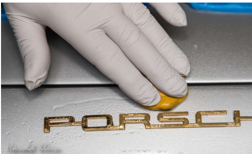
Clay removes the remaining dirt