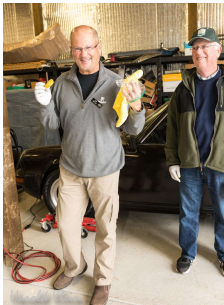
Hands-on with the Clay