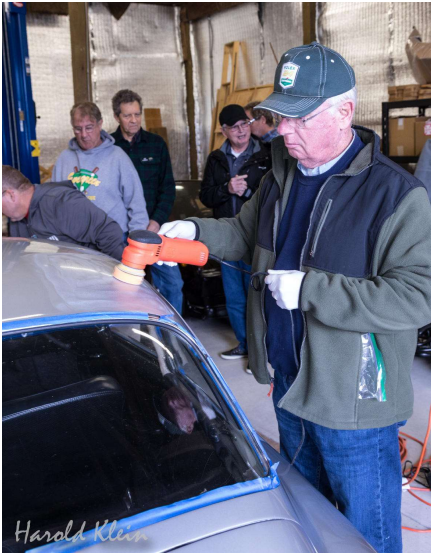
Applying the Compound