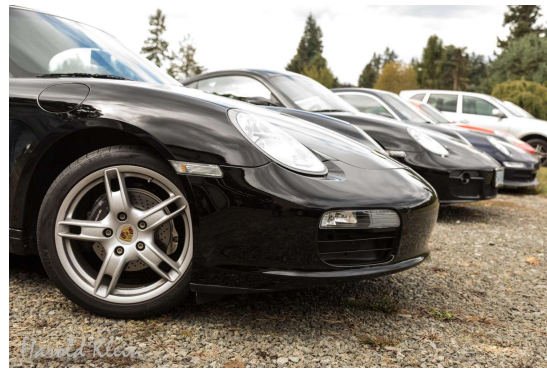
Porsches lined up outside Steve's garage