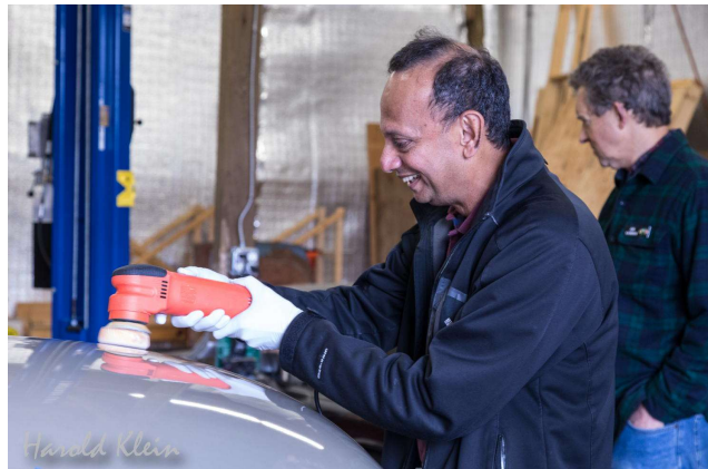
Yes - this is fun!