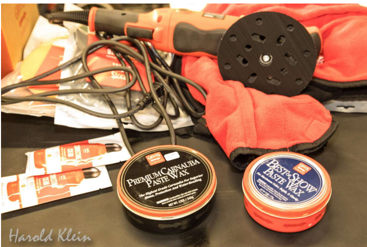
Paste wax options