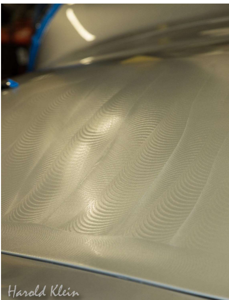
Wax is on!