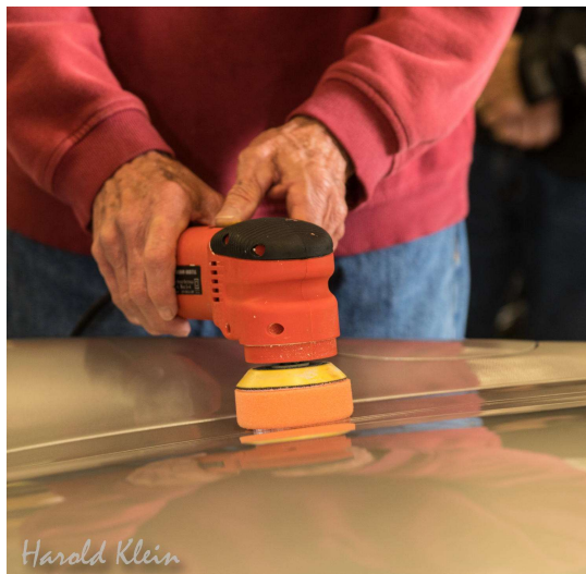
Jim showing us how to use the Orbital and putting compound on the car