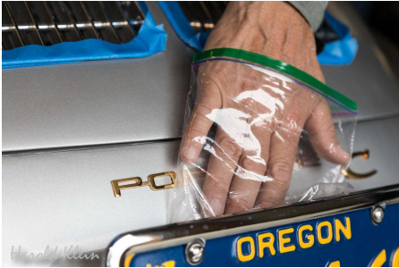
Plastic bags help feel the remaining dirt