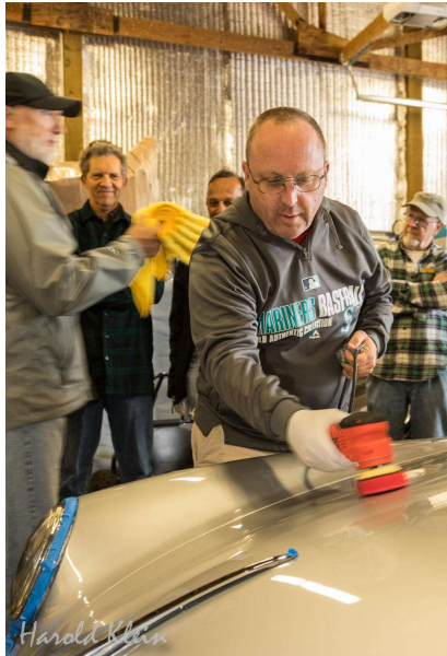
Applying the Wax