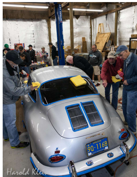
Microfleece wiping off the wax