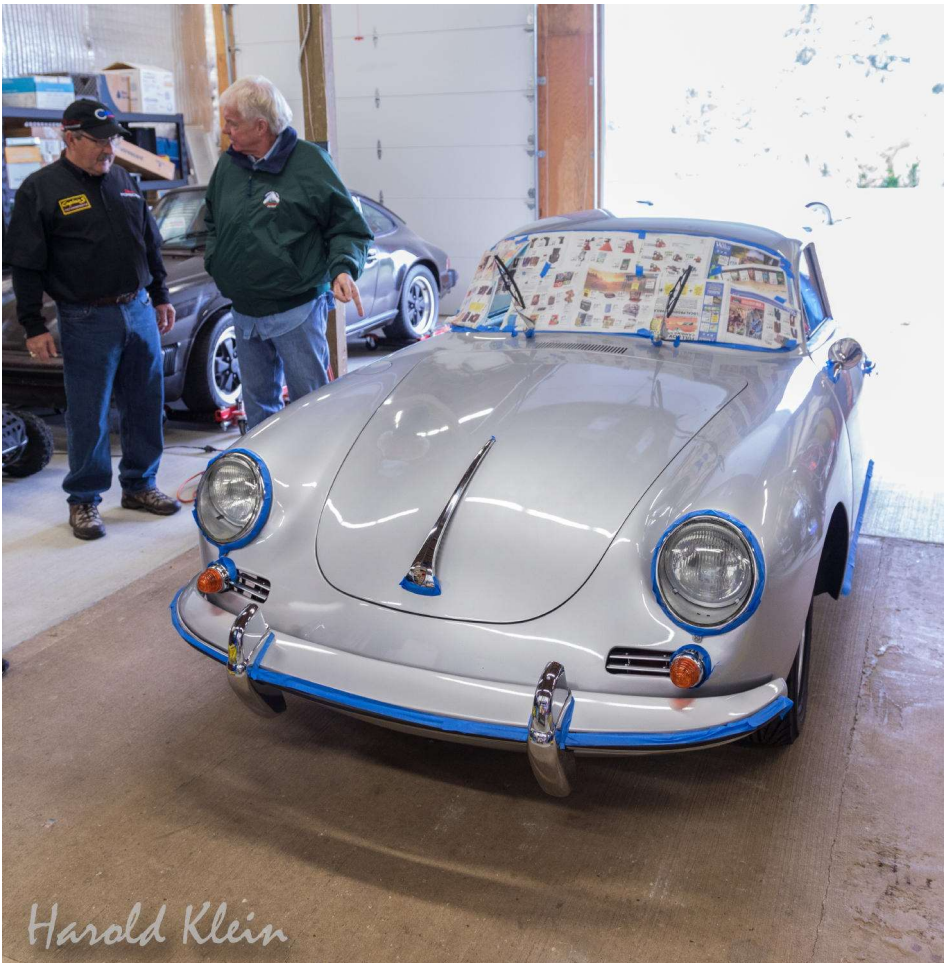
Steve's beautiful 356 was cleaned before we arrived (Step 1) and he had taped it up as well (Step 3)

Note: Use a wax remover if there is still dried on wax anywhere left over from previous waxings