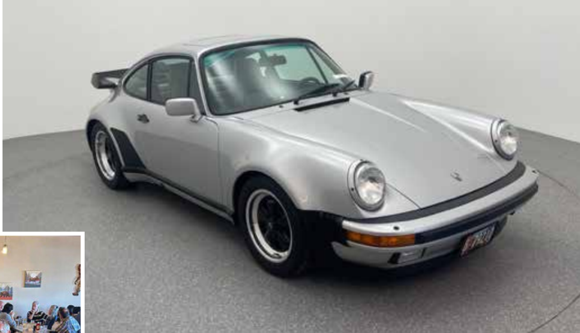
911 Turbo on turntable